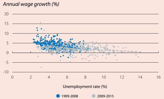
Note: * Each dot represents the annual figure for each state.